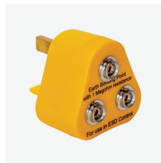
Earth Bonding Plug