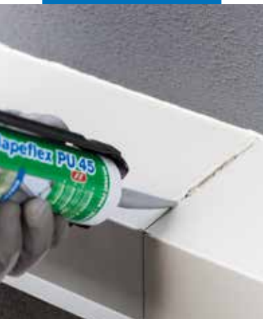
Flexible sealing of construction joints