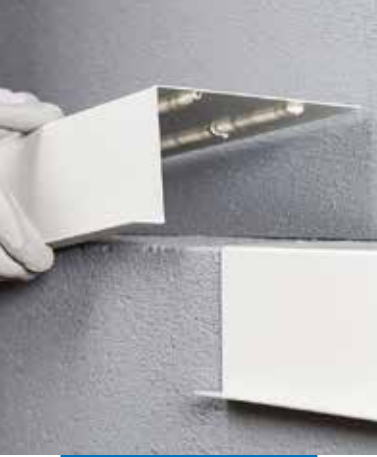
Flexible bonding of construction members and features

When bonding sections with a restricted surface area or weight, extrude single drops of the product on the back of the section and press it well down onto the substrate to spread the adhesive uniformly. When bonding sections with a large surface area, extract a